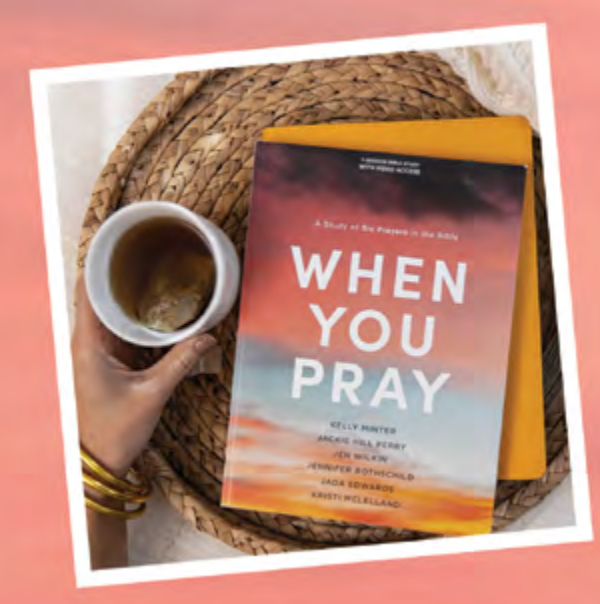
Mondays, Beginning Aug. 21 Noon | Room 2129